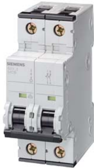
CIRCUIT BREAKER 400V 15KA, 2-POLE, C, 32A, D=70MM