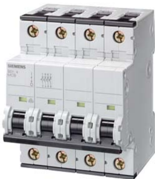
CIRCUIT BREAKER 400V 6KA, 4-POLE, C, 20A, D=70MM