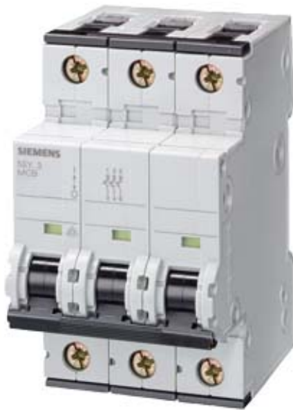
CIRCUIT BREAKER 400V 6KA, 3-POLE, C, 40A, D=70MM