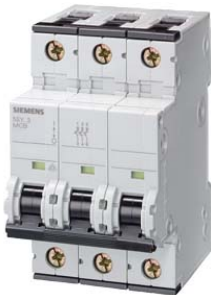
CIRCUIT BREAKER 400V 6KA, 3-POLE, C, 20A, D=70MM